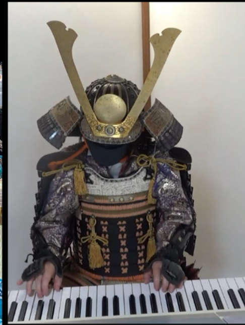
Playing keyboard, Koto